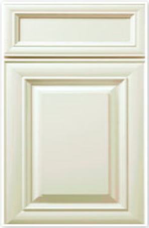
Antique White Paint