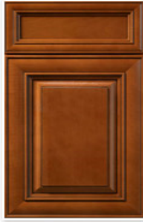
Heritage with Chocolate Glaze