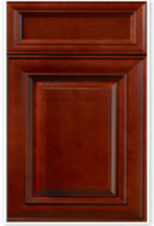
Crimson with Chocolate Glaze